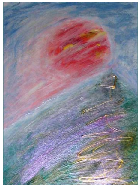
"Shooting for the Sun"

To make your order, email me at suzette@suzetteboulais.com .