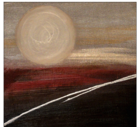
A SPACE OF PEACE

The First United Methodist Church in downtown Peoria is presently hosting a fine art exhibit featuring nearly 70 local area artists. I was pleased to submit " A Space of Peace " that is painted on a piece of fabric for a little added texture and dimension. While it is a common practice to paint the sun as a symbol of life, purchasers of my work often tell me they are attracted to the touch of red in my art and so I try to incorporate this color into my paintings, too.